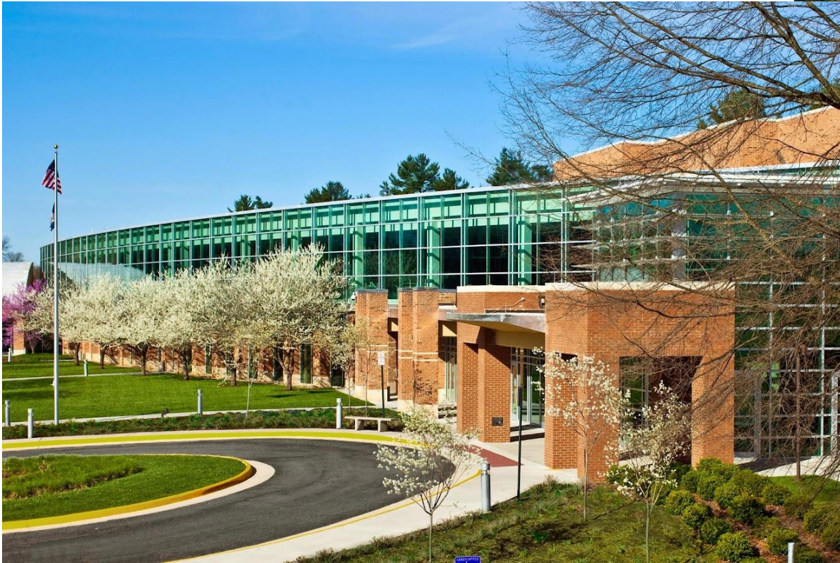
Southwest Virginia Higher Education Center Abingdon, VA