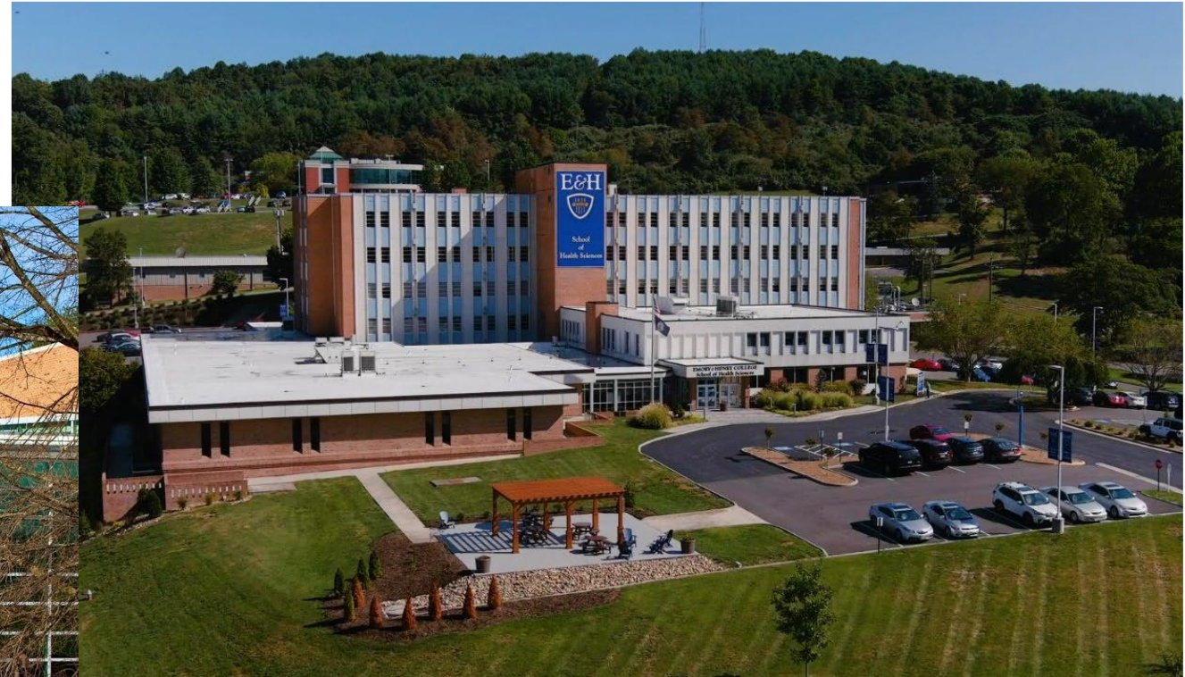
Emory & Henry College Health Sciences Campus, Marion, VA